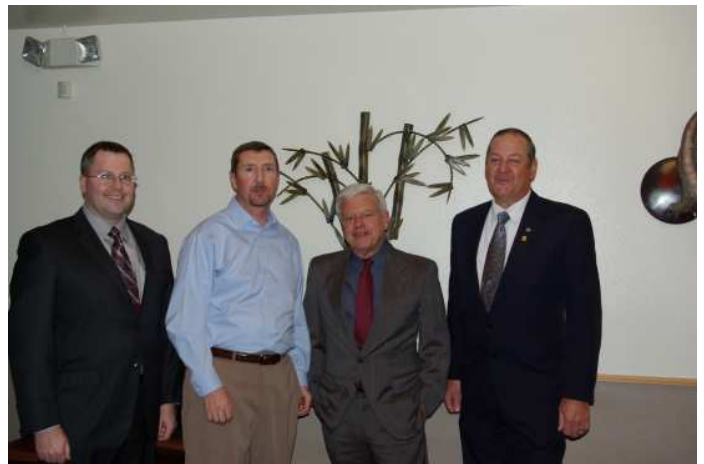
A Few Former Det 45 Superintendents from the Last Three Decades