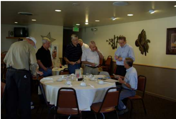
I owe HOW MUCH?