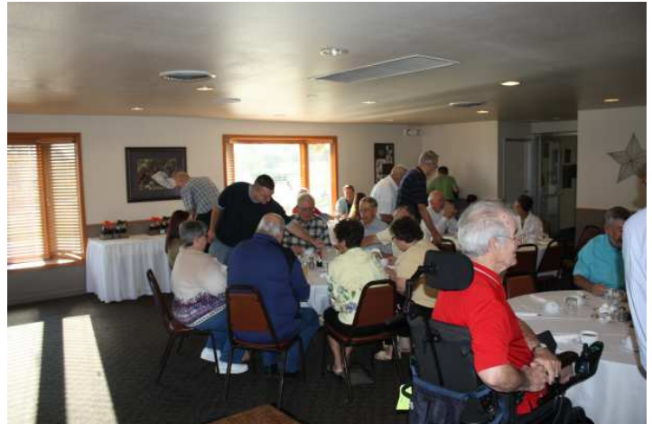
View Of attendees