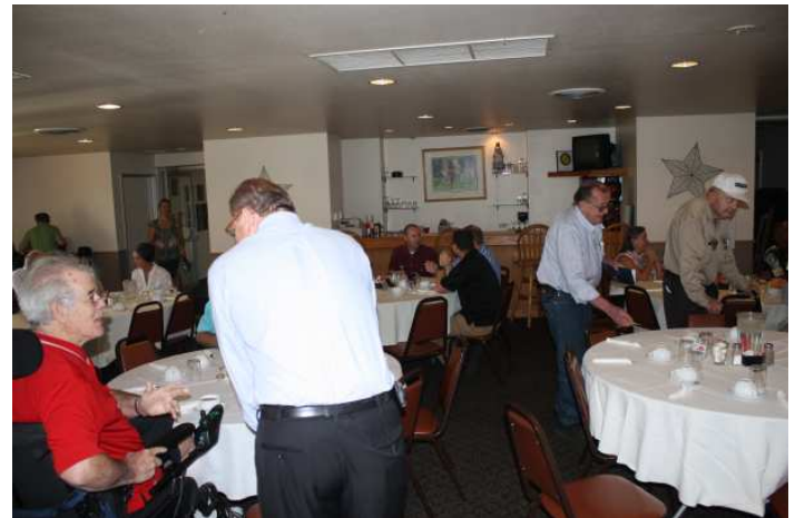
View Of attendees