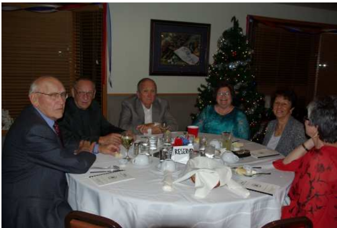
An Alumni Group Table