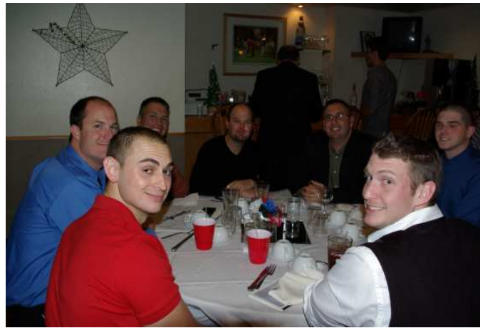
An Active Duty Group Table